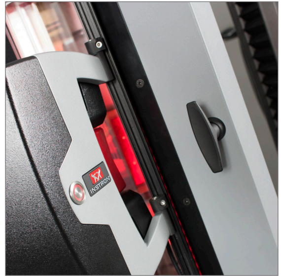
AVE 2 Mounted on a Temperature Chamber