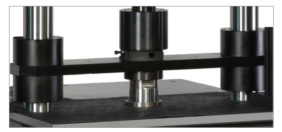
300LX with Linear Guidance option (H2)